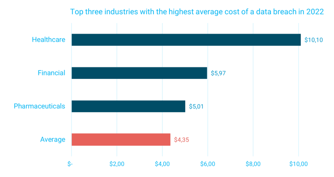
Based on the IBM report "Cost of a Data Breach Report 2022. Numbers are measured in USD millions.

The healthcare industry is highly targeted, with a 42% increase in the cost of a breach since 2020. For the 12th year in a row, the healthcare industry had the highest average data breach cost of any industry averaging $10,10 million. After healthcare and financial services ($5,97 million), the pharmaceutical industry has the third highest cost – averaging $5,01 million, 1,2 times the global average.<sup>1</sup>